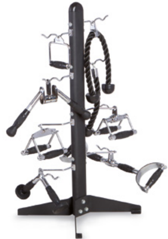
LOW PULLEY BAR